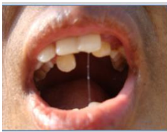
Fig. 1: Supernumerary teeth