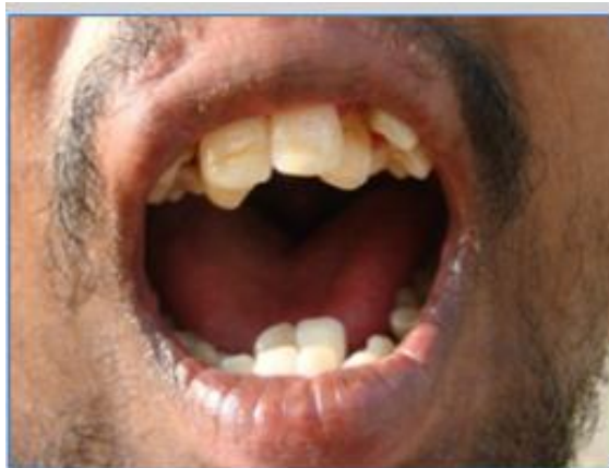
Fig. 2: Showing supernumerary teeth